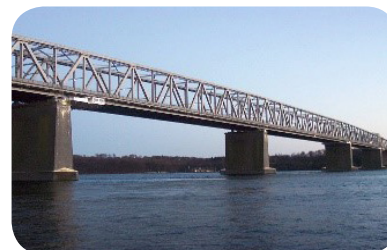
Molybdenum & Niobium Steels: Automotive, Gas Pipeline and Structural applications