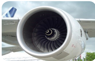
Rhenium Aerospace super-alloys